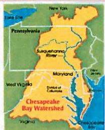
Chesapeake Bay Watershed

The Maryland DNR Forest Service presents the "Backyard Buffers" program. This program is designed to assist homeowners with land five acres or less, who have a stream or other waterway on or adjacent to their property to create a streamside buffer of native trees and shrubs. A streamside buffer can create habitat for wildlife, reduce peak water temperatures, and reduce the amount of sediment, fertilizer, and toxic materials that enter our waterways. Deep-rooted trees and shrubs can also stabilize stream banks, protecting them from erosion.