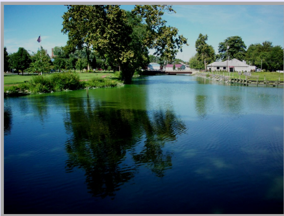
Excess nitrogen causes algae blooms , which can lead to fish kills.

The presence of pet waste in the water pollutes drinking water, can shut down swimming and fishing areas, destroys aquatic habitat, and leads to a decline in fish populations.