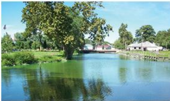
Figure 3. Algae on Broad Creek in Laurel, Delaware, on August 23, 2011, prior to Hurricane Irene.

*Scores for Fishing Bay Watershed were included in this report due to its relevance and proximity to the Nanticoke, but were not included in calculations for the Rivers and Creeks "Final Grade." Fishing Bay scores are based on five sampling sites only, which are monitored by Dorchester Citizens for Planned Growth (DCPG). See Figure 3 for the locations of these sites.