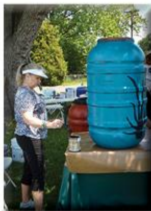
Figure 5: Rain barrels act as cisterns, storing water until needed for watering the garden or for other outdoors purposes. Rain barrel owners reduce runoff, conserve water, and save money. Every inch of rain that falls on a 1,000 square foot surface yields 600 gallons of rainwater.

Human and Animal Waste can add excess nutrients to the Nanticoke, in turn reducing the amount of oxygen availability. It also can lead to a buildup of bacteria that may cause illnesses in humans who come in contact with contaminated waterways.