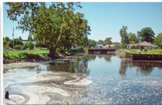
Figure 4. Broad Creek in Laurel, Delaware, on August 30, 2011, following Hurricane Irene.